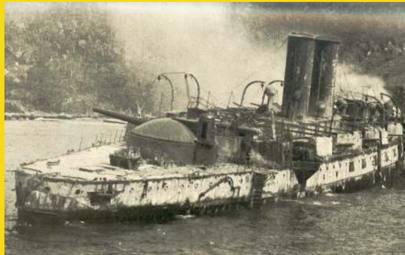
1898, W. R. Hearst, Cruise Armored Admiral Oquendo after the battle

It is a privilege, to know the history through these jetsams, exceptional witness of those events, and to decipher the language that you/they bequeath us, a treasure of the Cultural Patrimony Subacuático, in which the right of the future generations is conserved of penetrating in a transcendent page of the universal history.