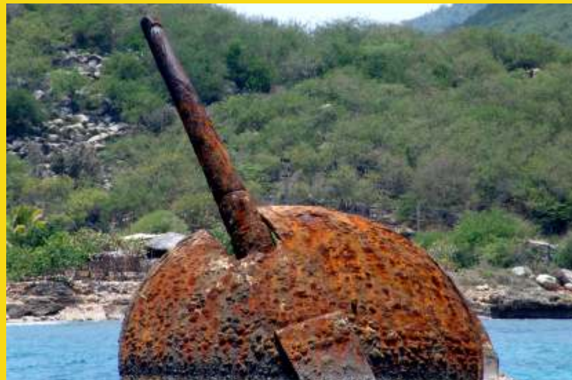
Remains of the Cruise Armored Admiral Oquendo