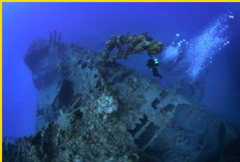
Jetsam Armored Cruise Christopher Columbus

The beaches "The Mule" in Ocuja of the Turquino, "Juan González", "Bueycabón", "Ranch Cruz", "Green Sea" and the own bay santiaguera constitutes true archaeological places in those that