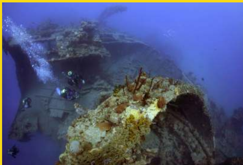
Jetsam Armored Cruise Christopher Columbus